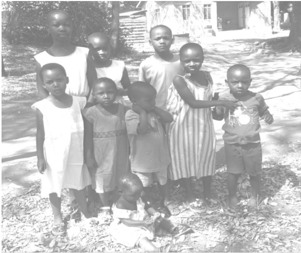
Mission staff children modeling clothes donated by some of you!

were so happy and thankful. We then took the remaining items (which still filled 2 totes) to the hospital where all the items were distributed to patients, patients' children and working staffs' children. Thank you to all who gave clothing and shoes for gifts. You helped many who were in need.