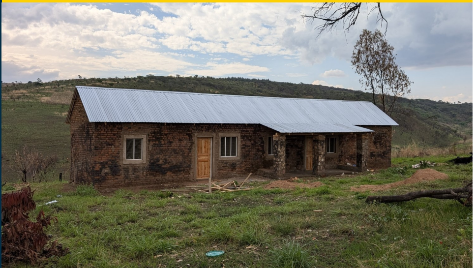
A small three room house - formerly believed to be an old German store.

The history of the Chimala Mission would be incomplete without the mentioning of what is known as the Ailsa farm up 3,000 more feet behind the primary mission property. Once a flourishing mission of the Lord's church, its present value serves as a farm to promote the dream of creating a self-sustaining mission work. As the farm develops, the need for reliable and more permanent workers is increasing. Naturally, therefore, more housing is needed. In the picture below, one of the many existing ruins on the property has just been rebuilt in preparation of new tenants. The house has just been wired and is awaiting a small solar system to provide electricity.